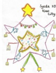
The Star London Eye